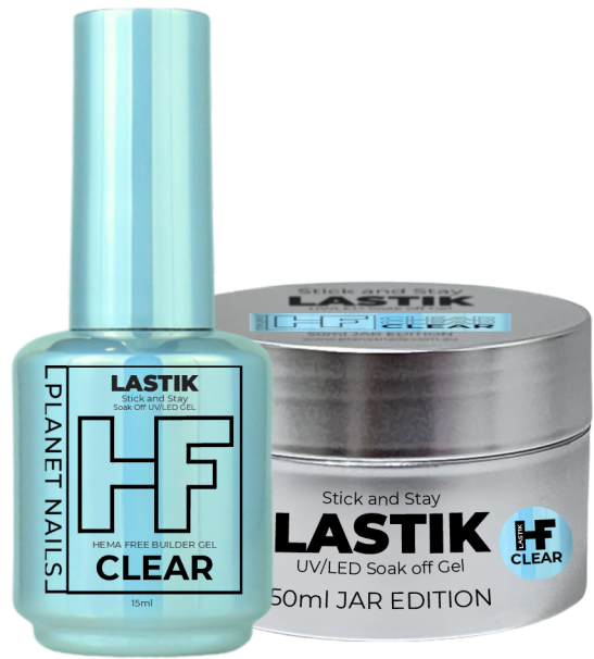
available in 15ml bottle and 50ml jar SAME PRODUCT, AVAILABLE IN BOTTLE AND JAR